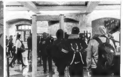
New York School